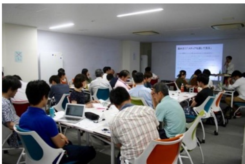
WASEDA 共創館 @早稻田(本部)キャンパス